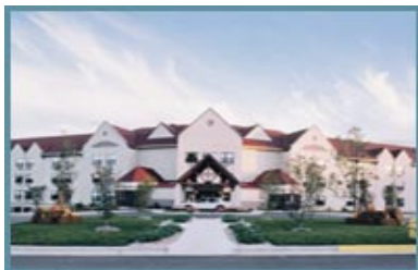
Welk Main Bldg.

WHEN: 15 - 17 Sept., 2003 (Mon. - Tues. - Wed.)